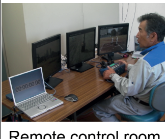
Remote control room