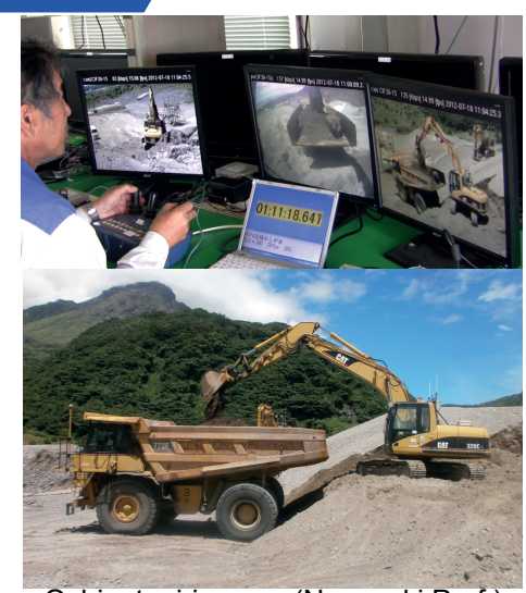
Oshigatani-jyouryu (Nagasaki Pref.)