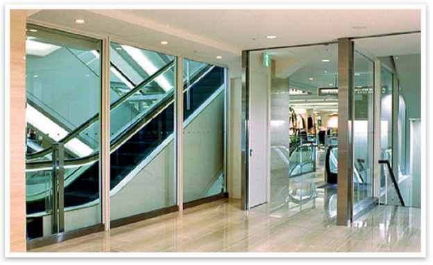
Fireproof glass screen surrounding escalator