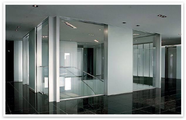
Fireproof glass screen and fire prevention door of the building core